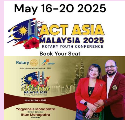
ACT ASIA Rotary Youth Conference May 16 to 20 at Malaysia