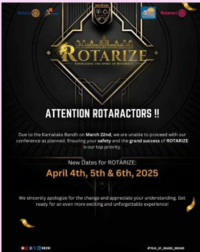
District Rotaract conference at Mysore on April 4,5,6 th 2025