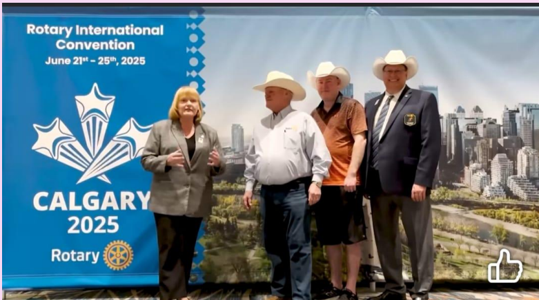
Rotary International Convention to be held at Calgary Canada from June 21 to 25